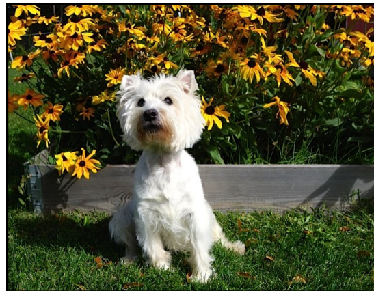
Blaze enjoying the beautiful Fall weather.