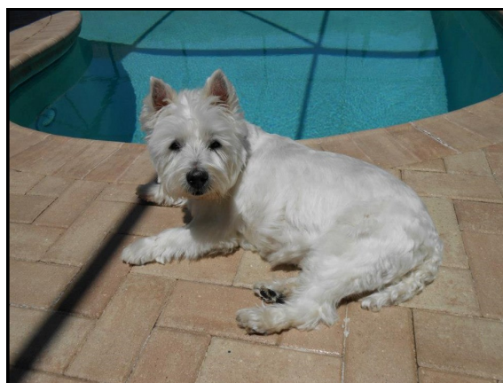
Mac lounging by the pool.

“In October 2011 we decided we wanted to get a dog, at the time I was 21 and my husband was 25. I grew up with a Westie and I knew I wanted my own so we contacted WRN to try to get a young dog. As we looked into which dogs were available, we chose a little old man named Cory. At the time Cory was 11 years old but I knew I could give him a great life for the rest of his life, however long that may be.