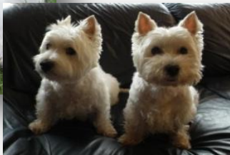
Delta Dawn & Heath

We expect to adopt out just over 20 dogs this year. The average age of these dogs has jumped from 5+ years to over 8. Almost all the dogs that have come to us this year have required extensive dental work. Several have needed surgery, physical therapy and social training. Your donations insure that WRN can seek out the best service providers, foster parents and forever homes. As noted in our October newsletter, older dogs do take longer to place and require more veterinarian services. Because we discount our adoption fees for older dogs our need for your donations is greater than ever. Thank you for helping us through this most challenging year. If you have family and friends who might be interested in donating to WRN payments can be made on our website through PayPal or by sending a check directly to: